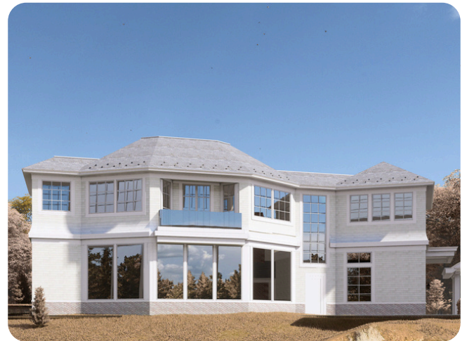
*NEW INDOOR CEREMONY SPACE & GETTING READY SUITES