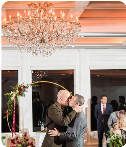
INDOOR & OUTDOOR CEREMONY OPTIONS